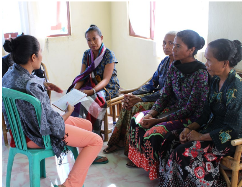
Women vendors rank their priority issues, and share their experiences and ideas for the future as part of a gendered marketplace assessment