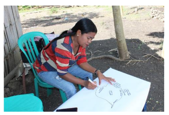
Figure 1. Liaison AEW carries out a mapping activity of women farmer groups in her suku.

The Liaison AEW's area of responsibility covers suku Balibo Vila, in the administrative post of Balibo, Bobonaro. At the time of the pilot, she was supporting four women groups in four separate aldeia in Balibo Vila, with each group comprising 12-16 members. Before implementing the pilot, the AEW carried out her regular role which involved forming groups of men and women farmers and providing them with technical support. Suku Balibo Vila met the criteria for the Liaison AEW pilot by having a female AEW (only one in 10 extension workers are women) and having a number of active women farmer groups. The AEW noted that