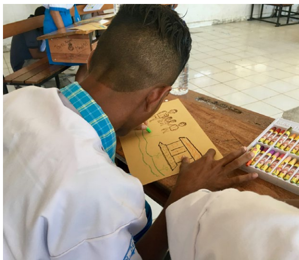
Adolescent participants draw their dreams for the future.