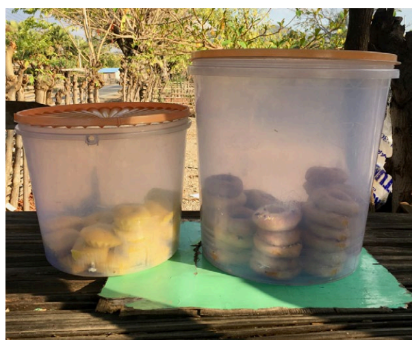
Nutritious snack options for adolescents in and around school are currently limited.

Preliminary findings of this research were presented back to key stakeholders and community members (adolescents, parents, teachers, local leaders) that participated in the study. Following the presentation, participants divided into groups and brainstormed healthier snack options that would meet adolescents three expressed criteria for snack selection (price, taste, and convenience). Below are the potential snack options from stakeholders and research participants in Baucau and Bobonaro: