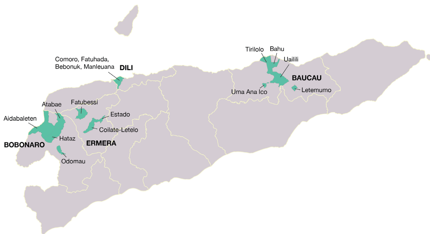
Figure 1. Map of selected suku for formative research activities

Purposive sampling was undertaken in four municipalities and 16 villages ( suku ), including two urban areas (Dili and Baucau municipalities), one semi-urban area (Bobonaro) and three rural areas (Baucau, Bobonaro and Ermera). Sampling considered factors such as Eastern and Western culturally distinct regions, most populous municipalities with diverse linguistic groups, cultural lineage systems (with at least one matrilineal site in Bobonaro selected), and TOMAK and WFP programme implementation areas (see Figure 1).