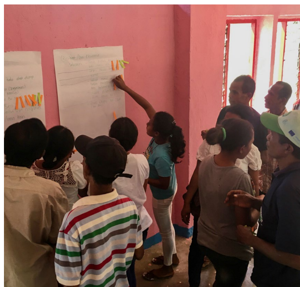
Participants struggled to separate challenges that are unique to adolescents during participatory community workshops.

Families dedicate a large proportion of available resources to cultural obligations, including both money and animals. The ongoing need for animal contributions means the majority of participants do not kill animals for family consumption, and therefore need to purchase animal source foods. Availability of these foods is limited by seasonal access to market due to bad roads. During the