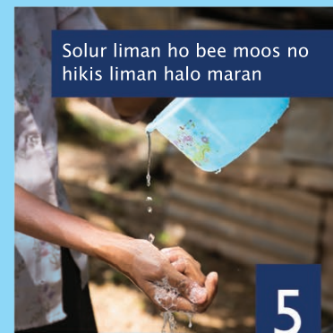
Solur liman ho bee moos no hikis liman halo maran