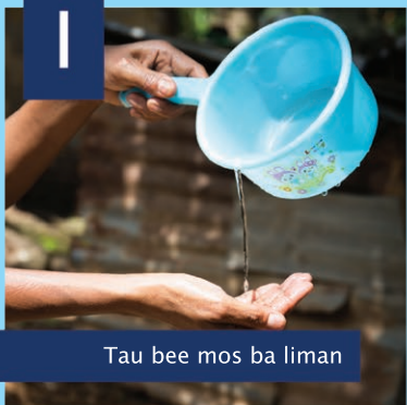
Tau bee mos ba liman

Bainhira mak ita tenke fase liman ho sabaun? Ita tenke fase liman ho sabaun beibeik! Sempre fase liman ho sabaun hafoin uza sentina ka hamoos bebé nia kidun, antes te'in/prepara ai-han, antes han ka fó-han bebé, hafoin kaer/ko'us animál no depois fani ka me'ar.