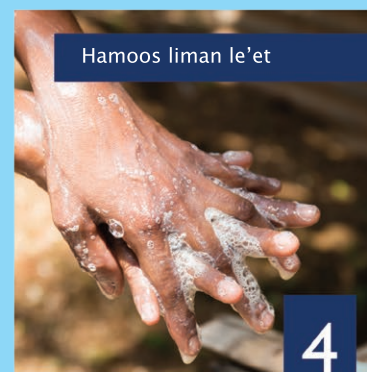
Hamoos liman le'et